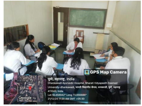
Department of Homoeopathic Materia Medica