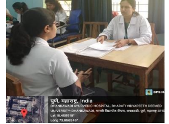
Department of Organon of Medicine and Homoeopathic Philosophy