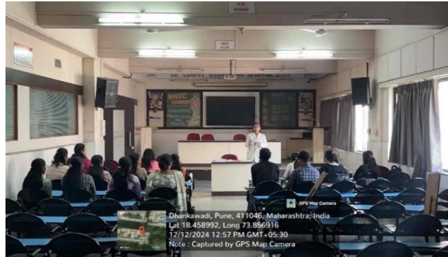
Integrative session – Department of Homoeopathic Repertory and Case Taking