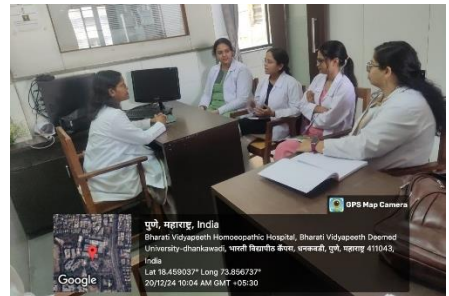
Department of Practice of Medicine