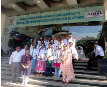
Visit to IRSHA