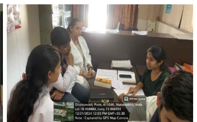
Department of Homoeopathic Repertory and Case Taking