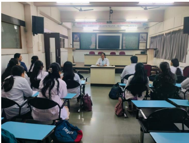
Integrative session – Department of Practice of Medicine