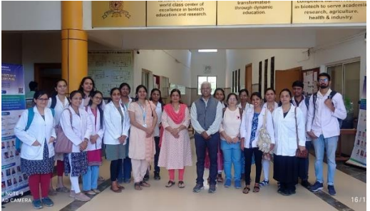
Visit to RGITBT