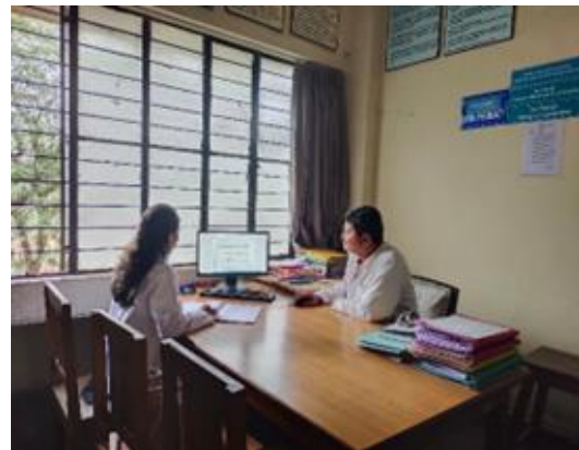
Department of Homoeopathic Pharmacy