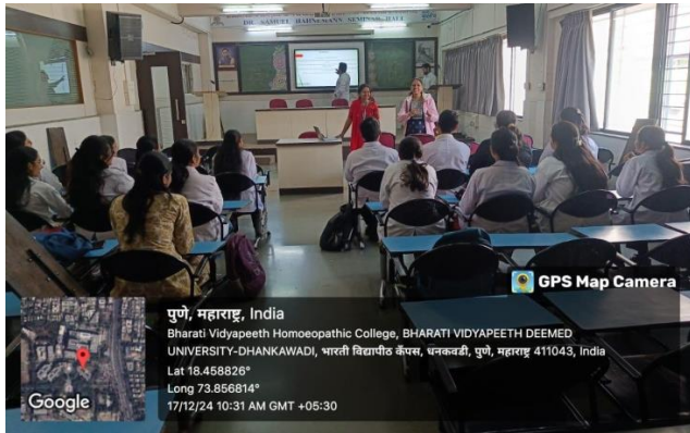
Integrative session – Department of Homoeopathic Materia Medica