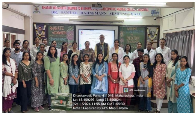
Group photo of 1 st PG CBDC Batch Scholars with Chief Guest, HOI and Faculty members