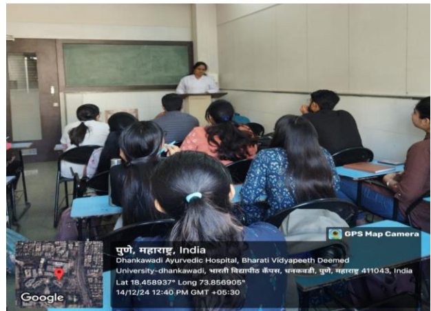
Integrative session – Department of Organon of Medicine and Homoeopathic Philosophy