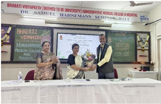
Felicitation of Chief Guest