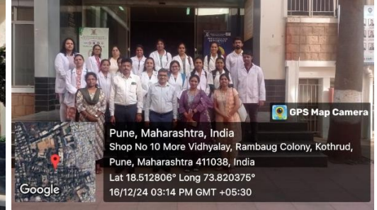
Visit to Poona College of Pharmacy